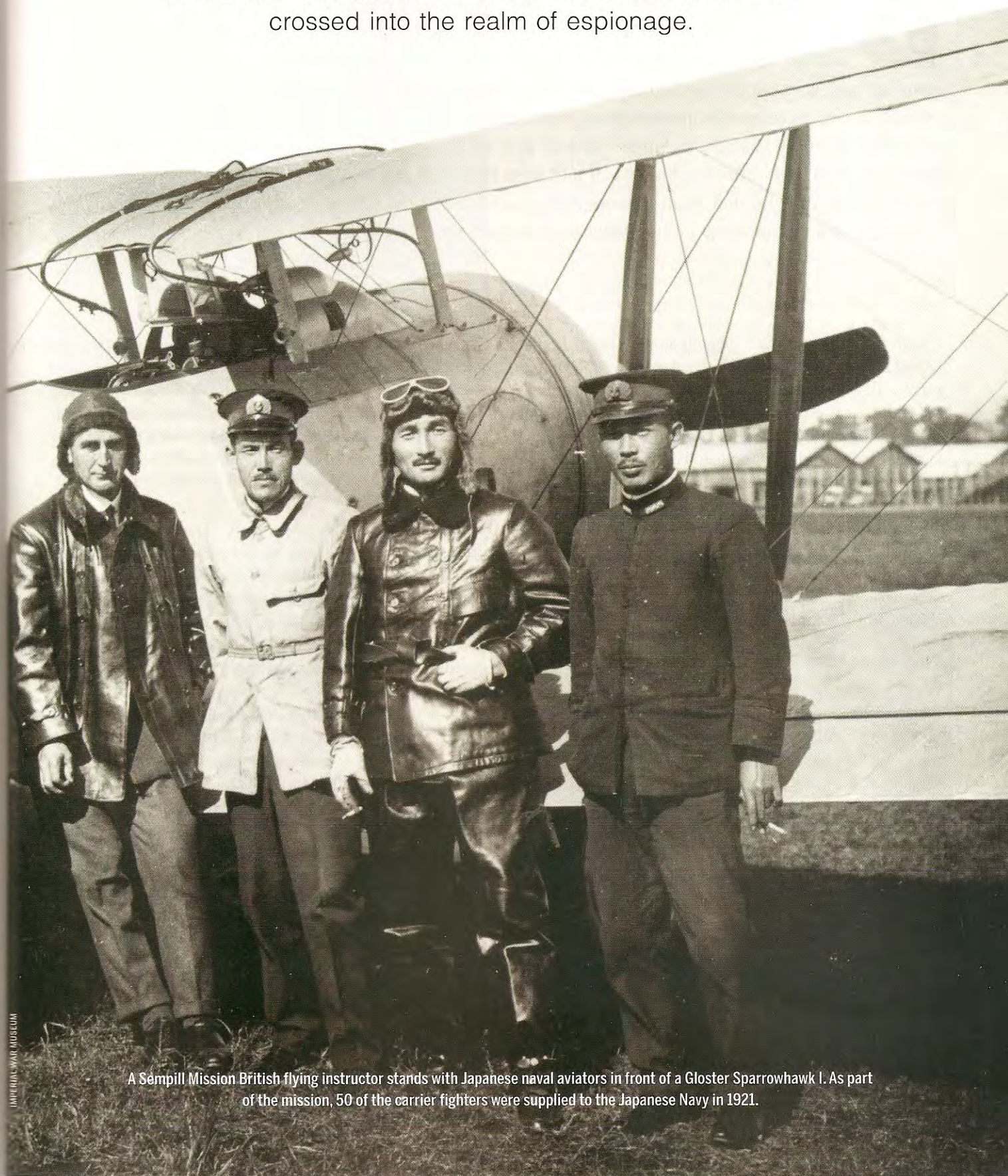
A Sempill Mission British flying instructor stands with Japanese naval aviators in front of a Gloster Sparrowhawk I. As part of the mission, 50 of the carrier fighters were supplied to the Japanese Navy in 1921.

Led by the Sempill Mission, British aviation experts assisted the Japanese Navy's nascent aerial program in the air and on the ground. But in some cases, the help crossed into the realm of espionage.