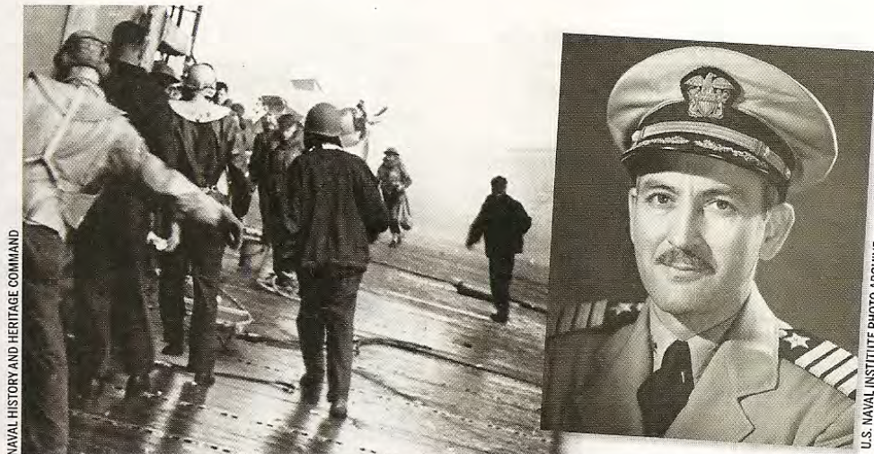
NAVAL HISTORY AND HERITAGE COMMAND