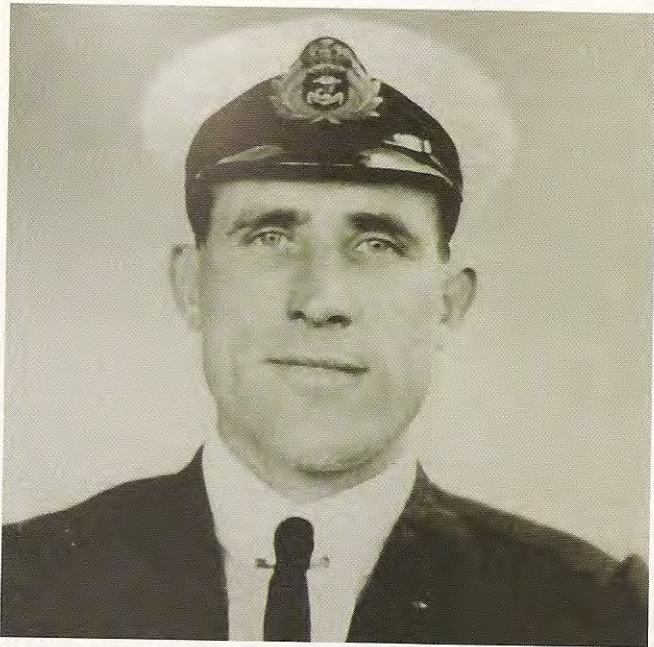
Not a member of the Sempill Mission, Battle of Jutland hero and aviation pioneer Frederick Rutland spied for Japan, providing information on aircraft carrier design. After the Pearl Harbor attack, he was interned for the duration of the war.

time, Blunt, as a member of what became known as the Cambridge Five, was spying for the Soviet Union. As he pointed out in his report, Japan ran its networks primarily through its embassies and consulates, which served as collecting points. Besides Japanese nationals gathering intelligence, British citizens, many with pro-Nazi and pro-Japanese sentiments, played a role.