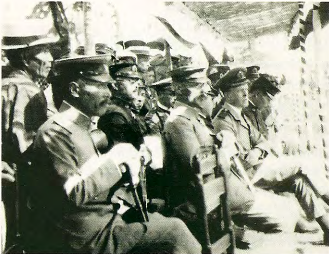
For members of the Sempill Mission, their assignment in Japan was not all work. Above: British advisers and Japanese Navy and Army officers enjoy a local festival that featured a Shinto ceremony and athletic contests.